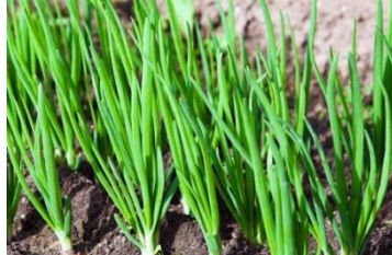
LO K I