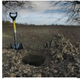
RA K A