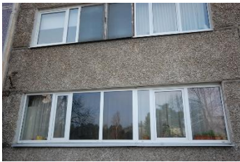
LO G I