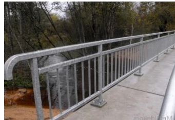
MARG K AS